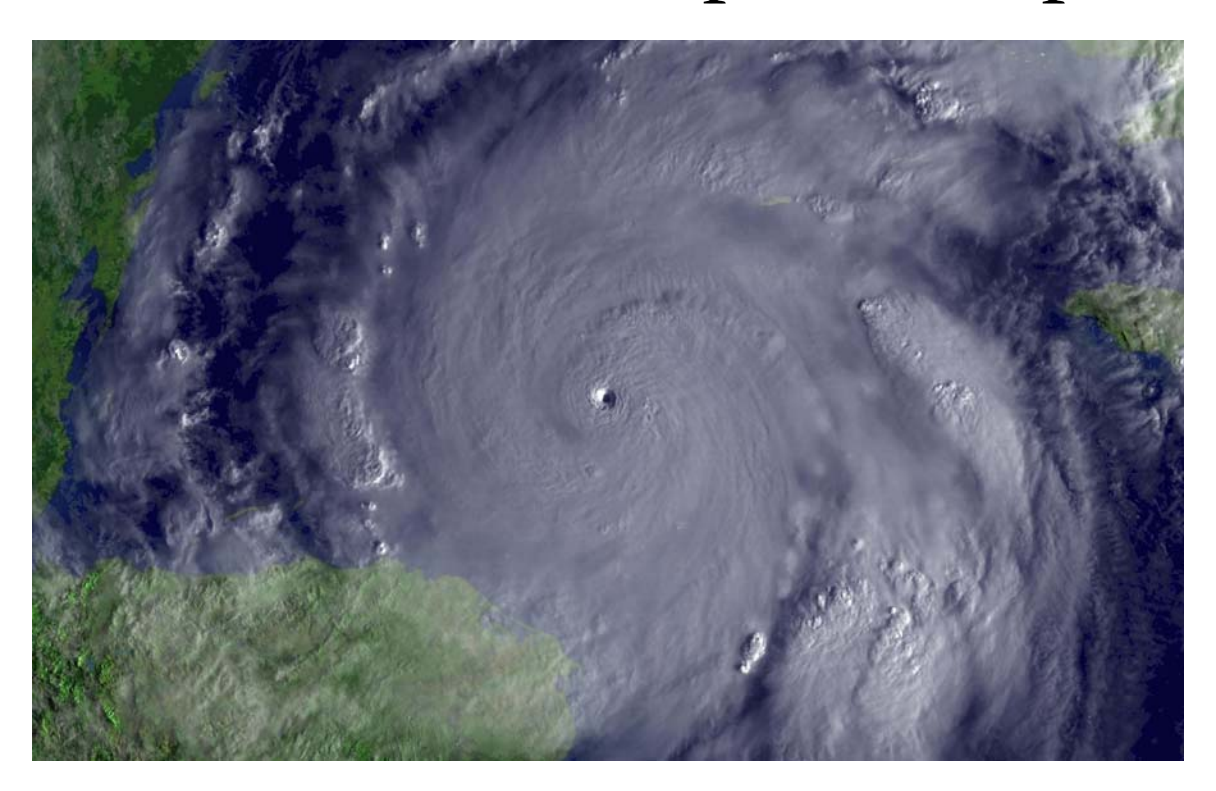
Prepared by Crawford & Company